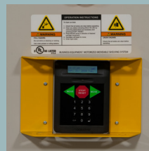
POWERED OPERATION with Touch Pad Control for ease of use and security.