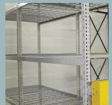
STORAGE CONFIGURATIONS Accommodates various pallet racking and shelving.

Bradford Systems Corporate Offices 430 Country Club Drive Bensenville, Illinois 60106 1-800-696-3453