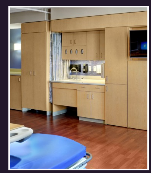
Patient Room Denver, Colorado