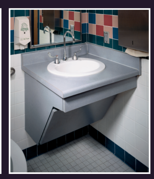
ADA Washroom Nashville, Tennessee