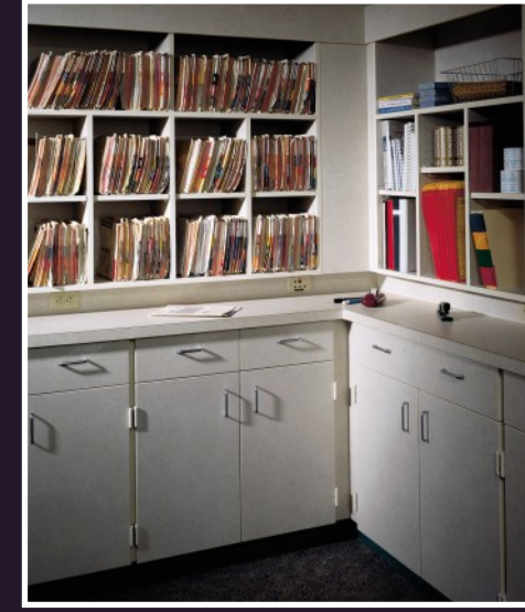
Medical Records Beachwood, Ohio