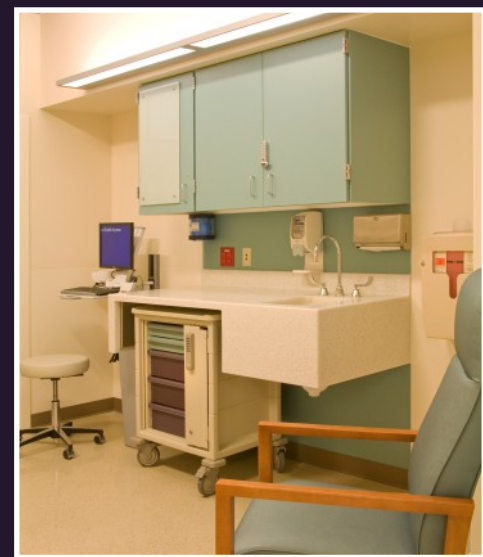
Clinical Exam Room Tacoma, Washington