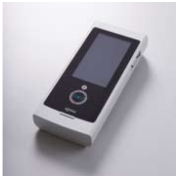
NFC WIRELESS PROGRAMMER