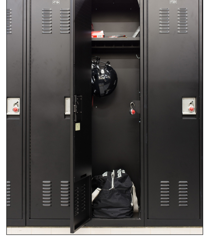
Specially designed recessed hasps and handles promote safety and enhance security