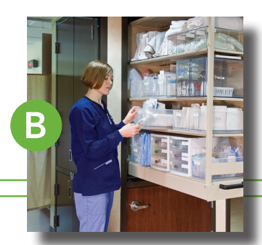
Extends fully outside the room for easy stocking. The CoreSTOR unit's patented slide design provides complete shelving access for increased efficiency.