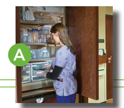
Totally accessible from inside the patient room. The entire shelf width is within easy sight and reach – just steps from the bedside.