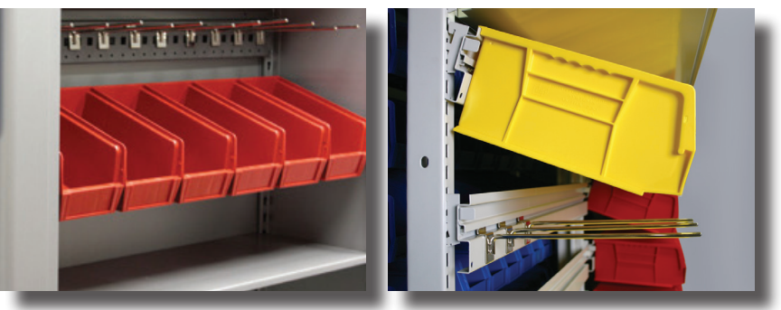
Flexible storage options let you design the storage that fits to a "T," from traditional 4-Post shelving to productive innovations such as the patent pending EZ Rail™ and FrameWRX™ storage systems.

Built for long service life, the sturdy carriage is engineered from lightweight aluminum and offers a 300 lb. load capacity.